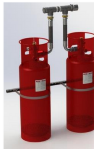
FSL 1230TM 25/42bar Container assembly numbers and technical specifications